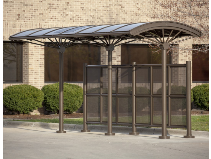
Shade series transit shelter powder coated in Mineral Bronze.

In addition to powder coating, Brasco offers two anodized aluminum finish options below. Anodizing may not be possible with your product's design if abundant welding is required.