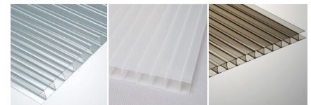
Clear White (Opal) Bronze

For roof glazing. All multiwall glazing is UV protected.