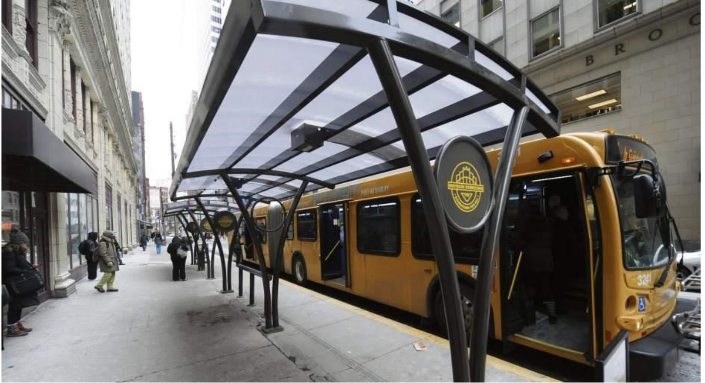
Brasco's Aero Shelter with Clear Twinwall Polycarbonate Roof Glazing